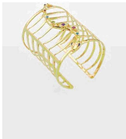
Missoma Serpent bangle